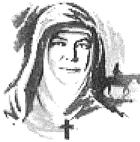
Blessed Mary MacKillop